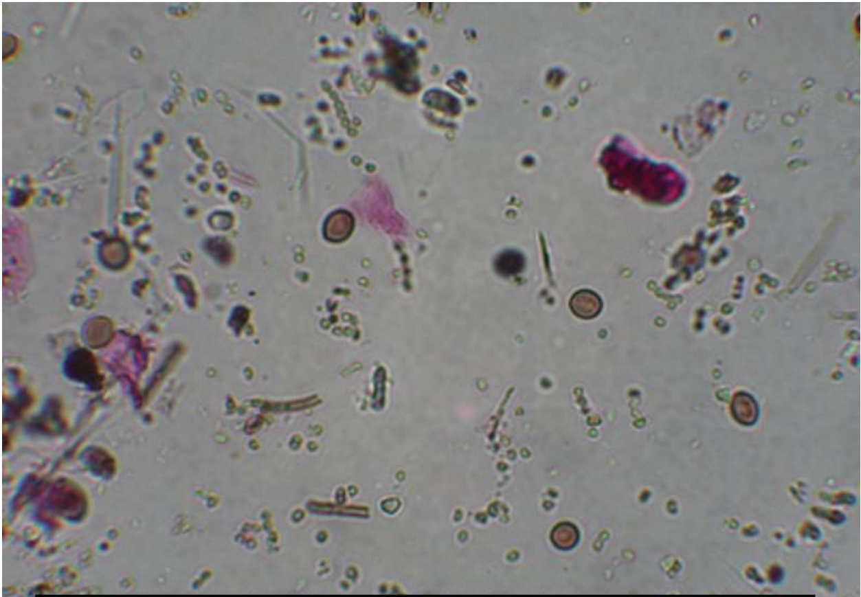
Fungal spores under the microscope